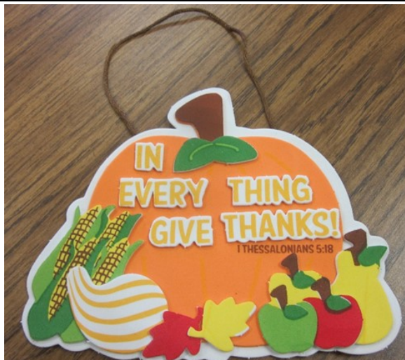
Happy Thanksgiving craft made by fifth and sixth graders for their friends at Scandia Village.