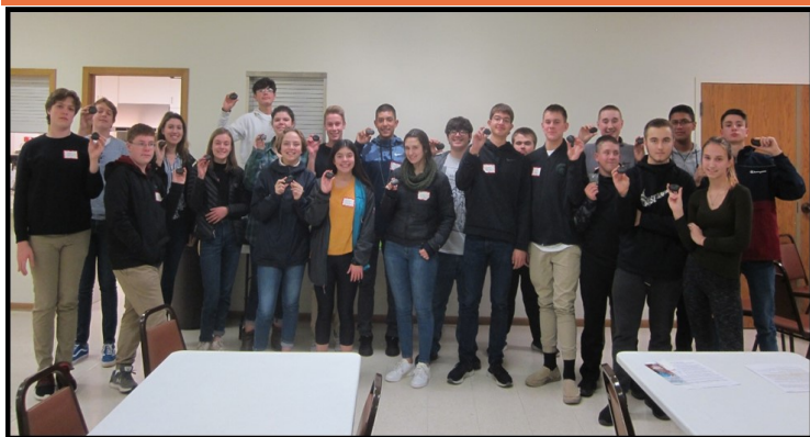
11-10-2019, Confirmation Retreat with 22 Students - Each holding a stone: Faith – Hope – Love – Peace – Joy - Friendship